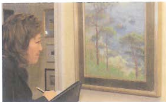
► Beyond merely providing coverage for expensive items, Fireman's Fund assigns a concierge to each client to handle questions, problems or losses.

But catering to this niche market involves more than just finding the appropriate coverage, explained Mr. Fiske. It is